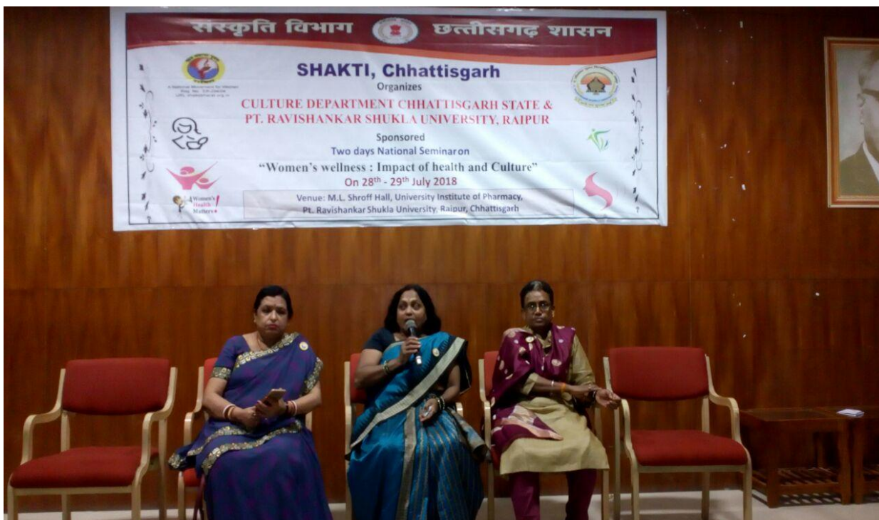
Sanskriti vibhag Chhattisgarh, Raipur & Shakti Chhattisgarh Mein Penal Disction Mein Bolte Huve