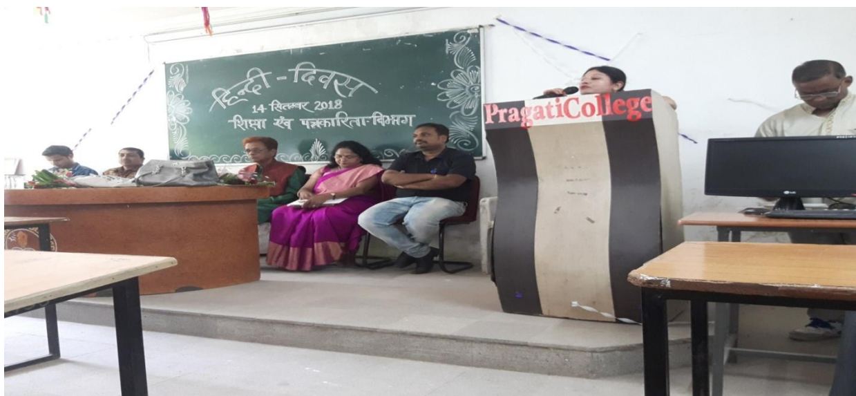
Lecture in Hindi Divas in Pragati College, Raipur

Lecture in Hindi Divas , in Pragati College, Raipur . 14.09.2018