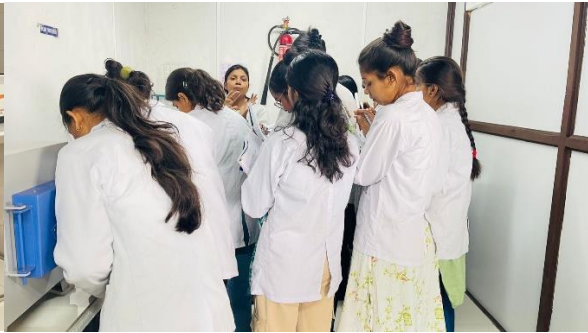
Group discussion and PowerPoint presentation